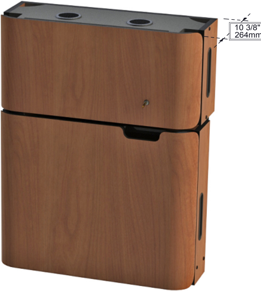
WILD CHERRY CXT-6015-7054 SHOWN