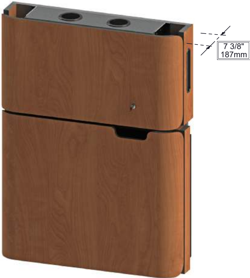
WILD CHERRY CXT-6036-7054 SHOWN